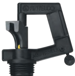
Rotor Rain® 3/8" Thread