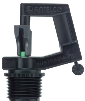
Rotor Rain® 1/2" Thread